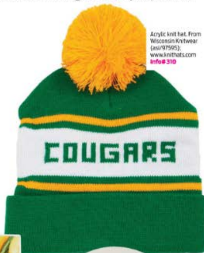
Acrylic knit hat. From Wisconsin Knitwear (asi/97595); www.knitshats.com Info# 310