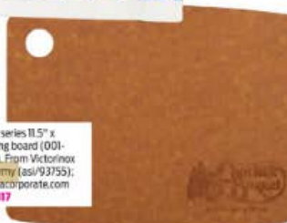
Kitchen series 11.5" x 9" cutting board (001-120901). From Victorinox Swiss Army (asi/93755); www.victorinox.com Info# 317