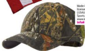
Made-in-the-USA licensed camo cap (USALC). From Kati Sportcap (asi/64140); www.katisportcap.com Info# 316