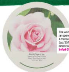
The world-famous jar opener. From Americanna Co. (asi/35730); www.americanna.com Info# 313