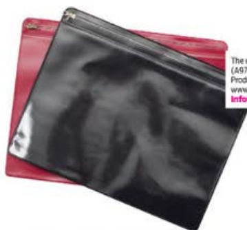
The essential portfolio (A972). From Mario Plastic Products (asi/68873); www.marioplastics.com Info# 309

Not everything is made in China and imported to the states. There are lots of American companies churning out quality products that can be branded. And you should be thankful there are – for many clients, the Made in the USA tag is not only important, but necessary.