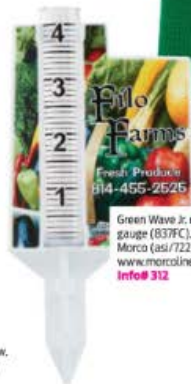
Green Wave Jr. rain gauge (837FC). From Morco (asi/72240); www.morcoinc.com Info# 312