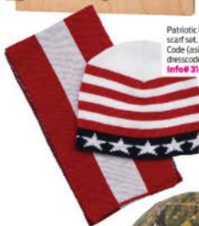
Patriotic beanie and scarf set. From Dress Code (asi/48342); www.dresscodesweater.com Info# 314